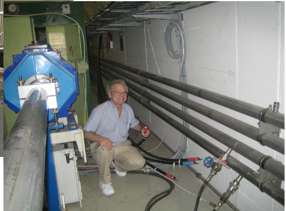
At the Experiment (TT2A)