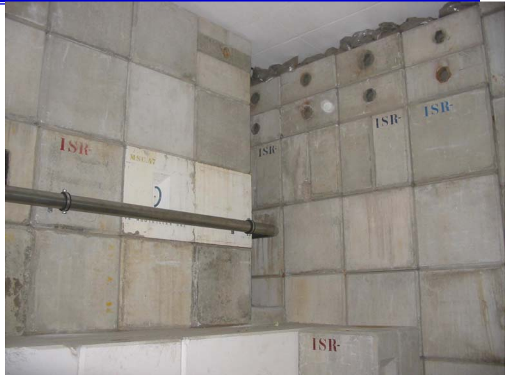
The N 2 vent line disappearing into TT10 area