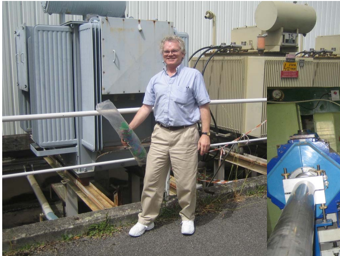
At the transformer (Bldg. 193)